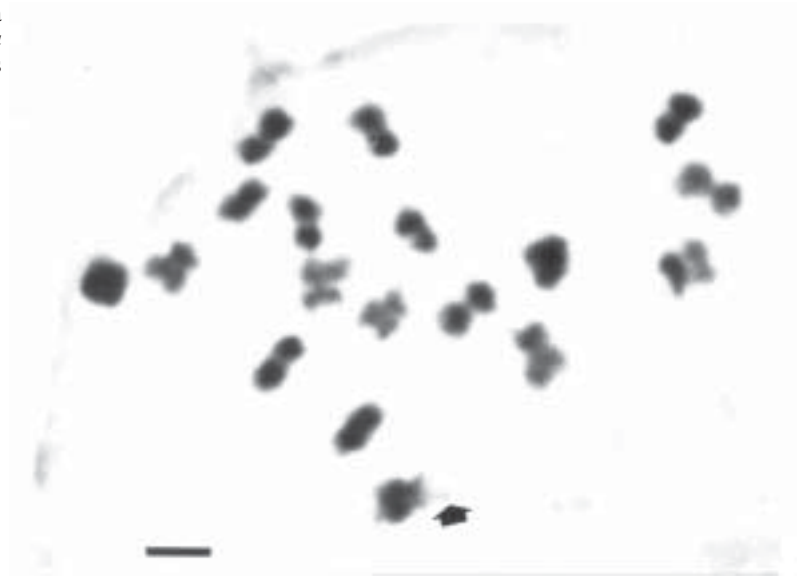
Fig. 1 Photomicrograph of a mitotic metaphase of Sophora tetraptera , 2n = 18 . Arrow points to a satellite. Scale bar = 2 \mu\text{m} .